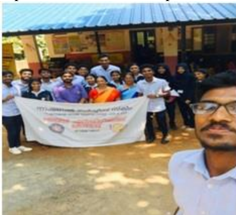
1 TH OCTOBER 2019 TREE PLANTATION: In relation with 150th birthday of gandhiji , trees were planted around the campus.