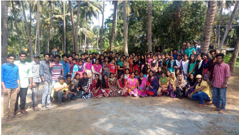
Seven Day Camp (2017-2018)