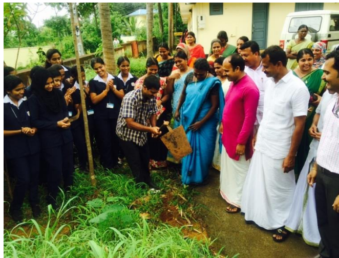
Panchayat office cleaning