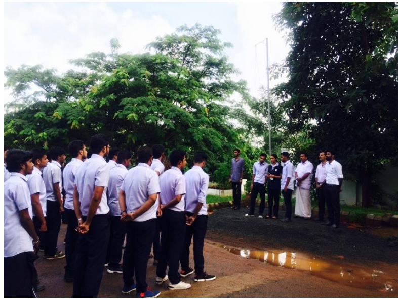
Flag hosting by chief guest and patriotic song singing by the volunteers