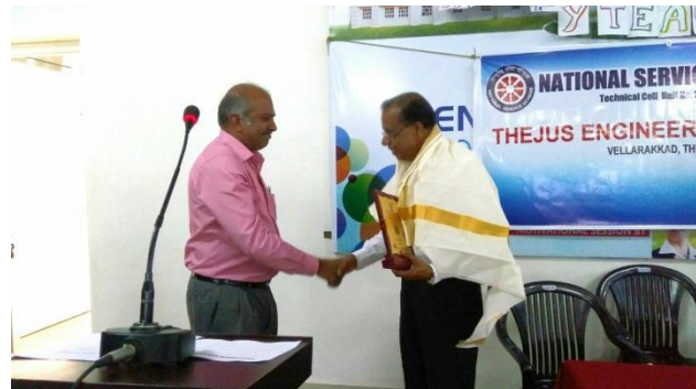
Teachers day Celebration