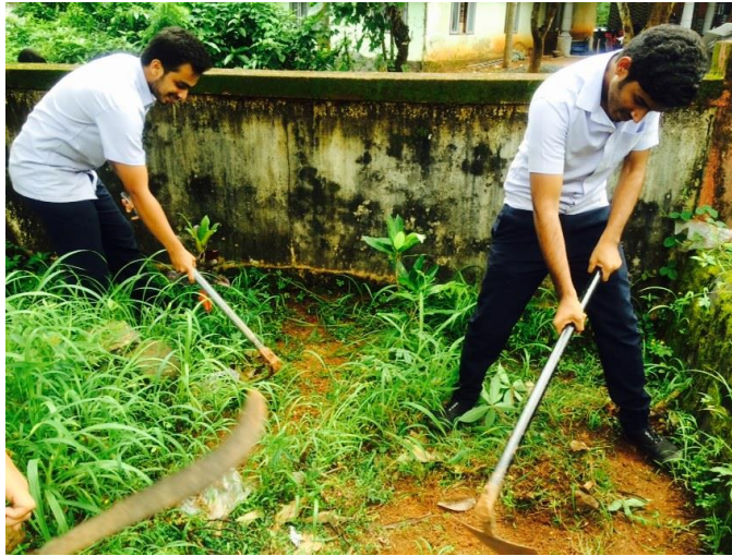
Road and Panchayat health center cleaning