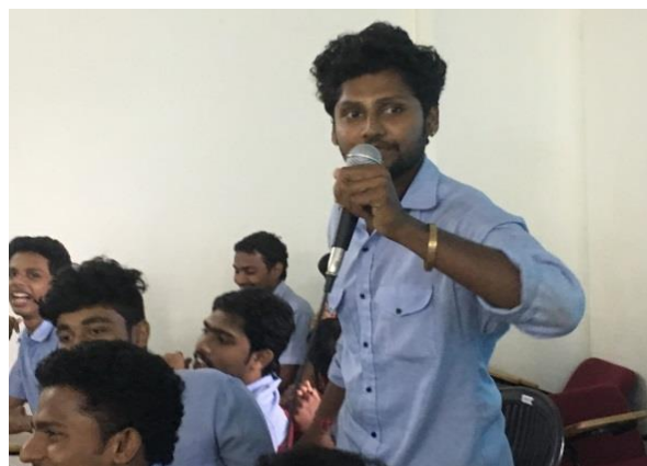
Interactive Session with Students