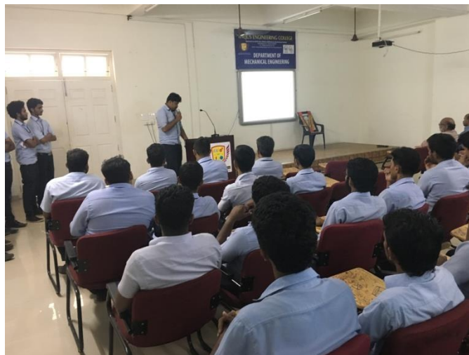
Engineers' day celebration